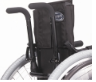
Adjustable height pushhandle with hide-away feature.